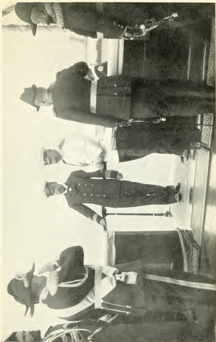
The two Emperors.